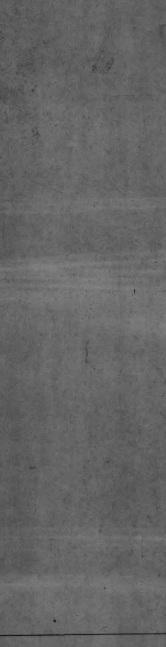
CROQUIS DE LOCALIZACION